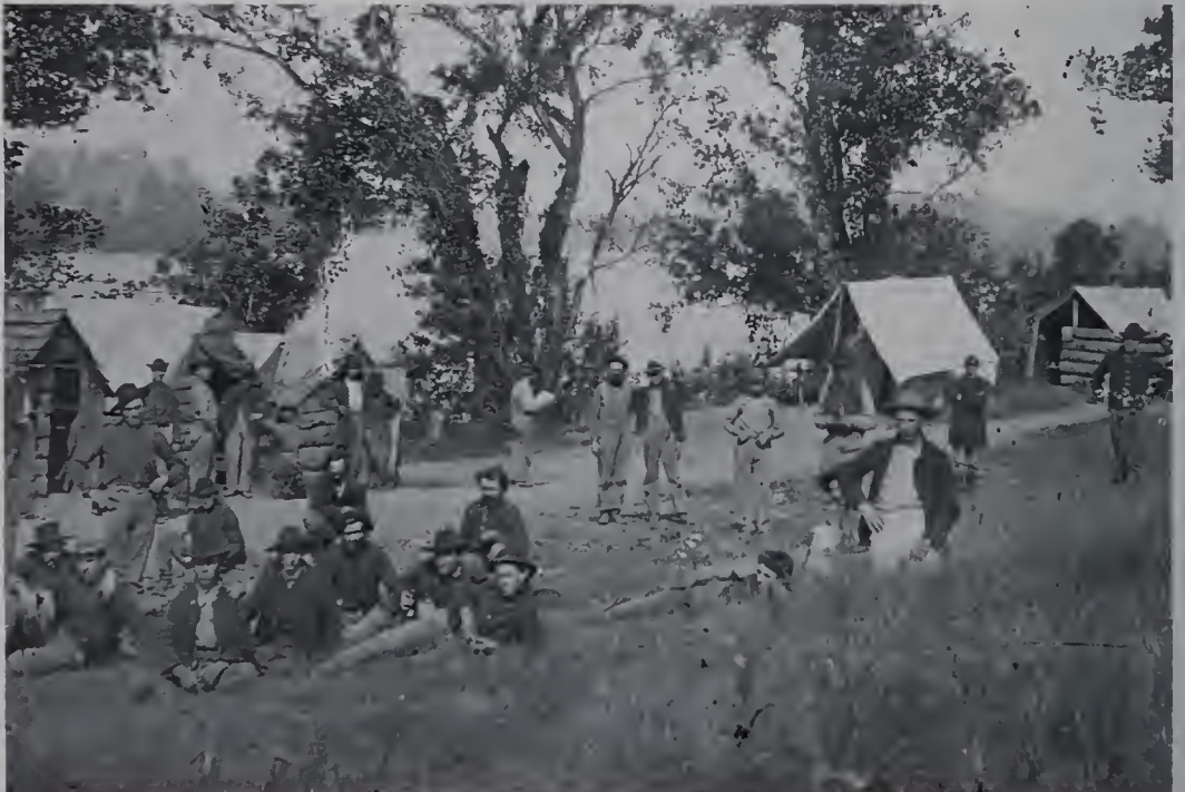
Union Soldiers encamped at Citico Creek, East of Chattanooga, Tennessee.

Includes bibliographical references (p. [153]–155) and index.